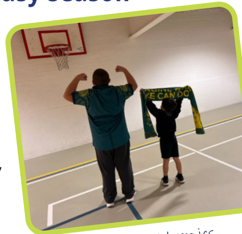
Check out our GBB Olympics Champions with their prizes!