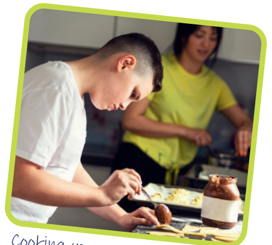
Cooking up a storm with the OzHarvest NEST program