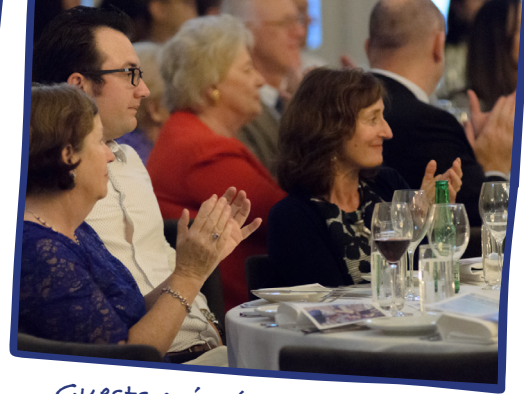
Guests enjoying the evening