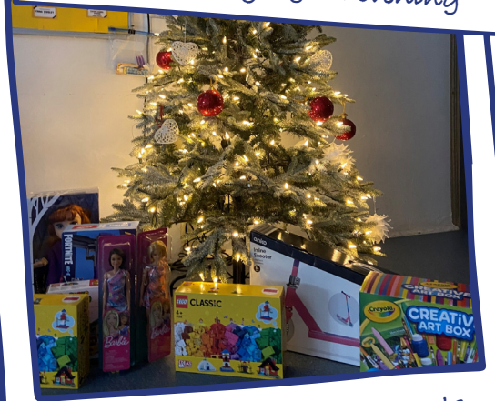
Fabulous Christmas presents