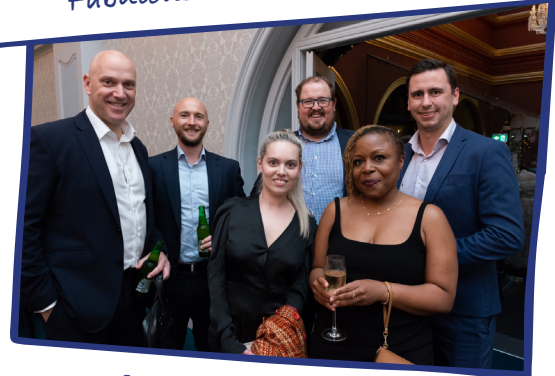
CountPlus One staff