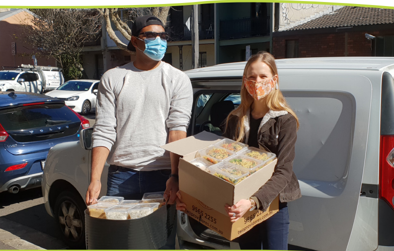
Fresh dinners being delivered by the team at Symbols of Hope.

Every week our team delivers freshly cooked, gourmet meals to families who need a break, taking the stress out of cooking dinner for the night.